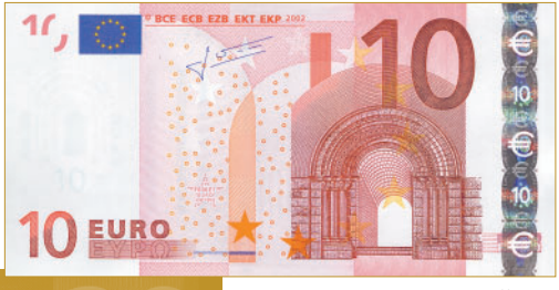
In 2008 all ECB publications feature a motif taken from the €10 banknote.