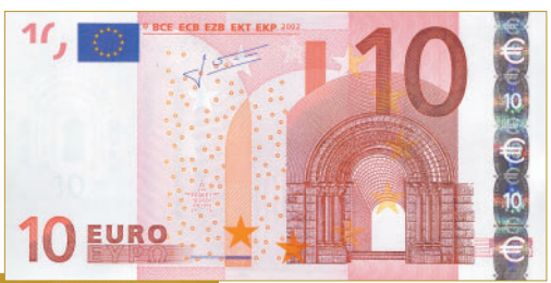
In 2008 all ECB publications feature a motif taken from the €10 banknote.

This paper can be downloaded without charge from http://www.ecb.europa.eu or from the Social Science Research Network electronic library at http://ssrn.com/abstract_id=1082738.