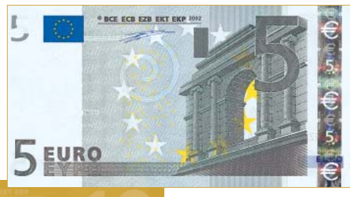
In 2006 all ECB publications will feature a motif taken from the €5 banknote.