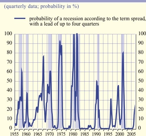
Chart B Probability of a US recession according to the term spread

Sources: Federal Reserve Economic Data (FRED), NBER and ECB calculations. Notes: Shaded areas refer to NBER-defined recessions. The probabilities are based on probit regression outcomes which are explained in footnote 2.