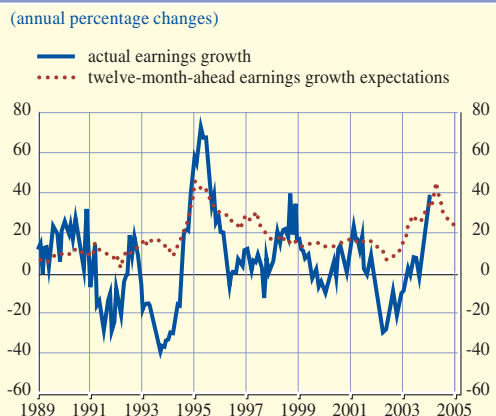
Chart A Earnings expectations and actual outcome for the MSCI euro area stock market index