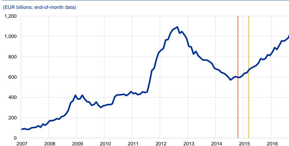
Chart A Total TARGET balance

TARGET balances have seen renewed increases since the launch of the Eurosystem’s asset purchase programme (APP; see Chart A). 1 TARGET balances are the claims and liabilities of euro area national central banks (NCBs) vis-à-vis the ECB that result from cross-border payments settled in central bank money. 2 Each NCB has either a positive balance (i.e. a claim in TARGET) or a negative balance (i.e. a liability in TARGET). When a country’s banking sector receives a cross-border inflow of central bank money, its claim increases or its liability decreases; cross-border outflows have the opposite effect. The total TARGET balance, which is the sum of all positive balances, 3 is only affected when central bank money flows between countries with positive and negative balances. 4 The launch of the APP has led to a rise in cross-border payments by purchasing central banks, which has caused renewed increases in the total TARGET balance.