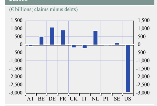
Chart A Net cross-border banking flows across selected EU countries and the United States