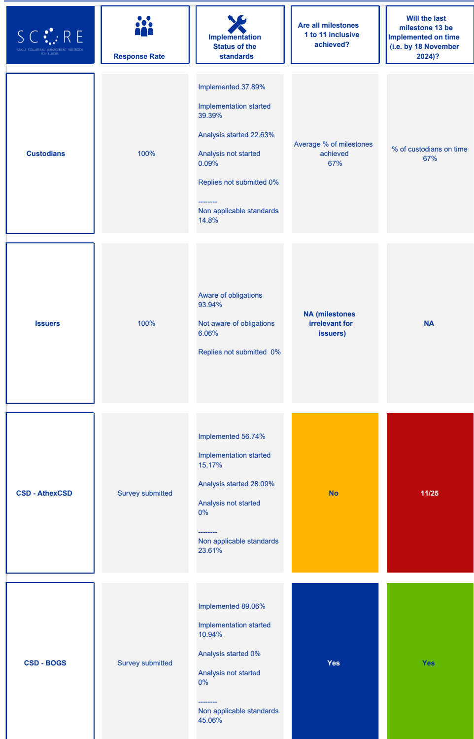
Figure 1 Summary of the monitoring exercise