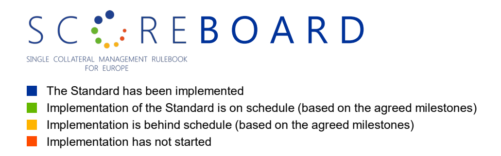
Table 1 Compliance level with the standards by each entity type