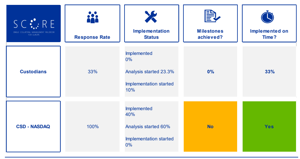
Note: Implemented on time reflects the entity's expected ability to achieve the final milestone on time

The SCoRE Overview provides a high-level summary of the H2 21 monitoring exercise.