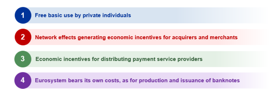
Figure 2: Eurosystem proposal for core principles for a compensation model

While the compensation model for a digital euro will be an important element of the legislative framework for a digital euro, to be decided by co-legislators, the Eurosystem has proposed a set of four core principles.<sup>15</sup> First, as a public good, a digital euro should be free of charge for basic use of private individuals for their day-to-day purposes. Second, legislative safeguards should prevent merchants from being overcharged by intermediaries. Third, intermediaries should still be compensated for the services they provide,<sup>16</sup> just as they are for other digital payments. Finally, the Eurosystem would bear its own costs.