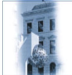
CENTRAL BANK OF IRELAND