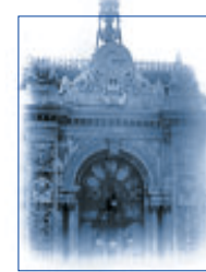
BANCO DE ESPAÑA