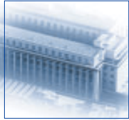
NATIONALE BANK VAN BELGIË/ BANQUE NATIONALE DE BELGIQUE