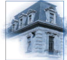
BANQUE CENTRALE DU LUXEMBOURG