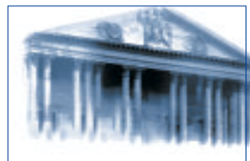
BANK OF ENGLAND