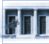
BANK OF GREECE