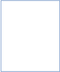
EUROPEAN CENTRAL BANK