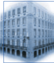
BANCO DE PORTUGAL