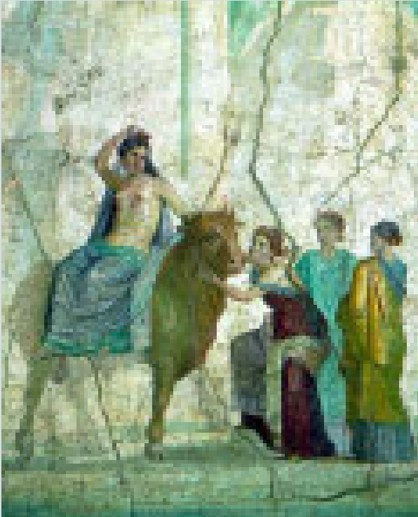
Europe riding on Taurus – ancient fresco found in Pompeii