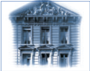
BANQUE DE FRANCE