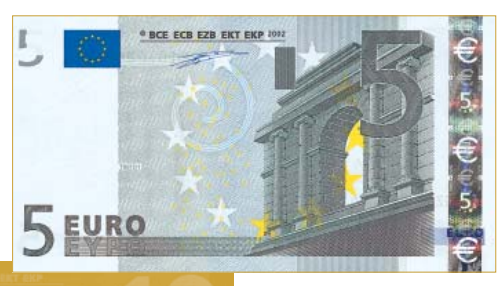
In 2006 all ECB publications will feature a motif taken from the €5 banknote.