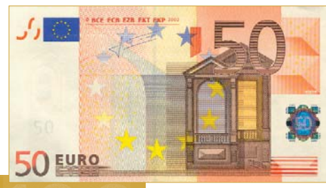
In 2005 all ECB publications will feature a motif taken from the €50 banknote.