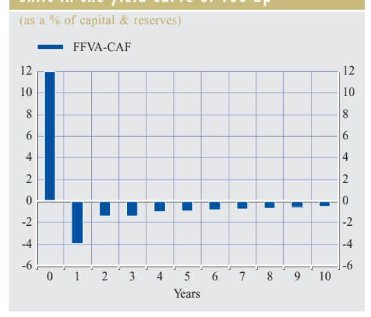
Chart I Difference between FFVA and the CAF in the P&L account from a downward shift in the yield curve of 100 bp

The earlier scenario of an interest rate decline can be combined with asset quality deterioration, with interesting results. For instance, if the deterioration in asset quality coincides with a recession and an alleviation of inflationary pressures, a decrease in interest rates (even though this would not occur as the kind of parallel shift simulated here) might alleviate the impact of the value adjustments under FFVA. In this case, the CAF with perfectly forward-looking – but not cyclically adjusted – provisioning might imply a wider correction of valuations than under FFVA, as offsetting the interest rate effect would not be taken into consideration.