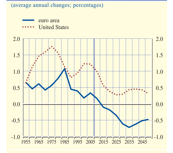
Chart I Working age population growth in the euro area and the United States – historical developments and projections

Sources: ECB calculations based on Eurostat and UN data. Notes: The working age population is defined as the population aged between 15 and 64. The growth rate is the average annual rate of change calculated over five-year periods ending in the year indicated.