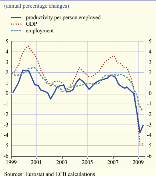
Chart B Growth of GDP, employment and productivity in the three largest euro area economies