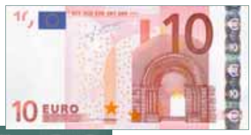
In 2008 all ECB publications feature a motif taken from the €10 banknote.